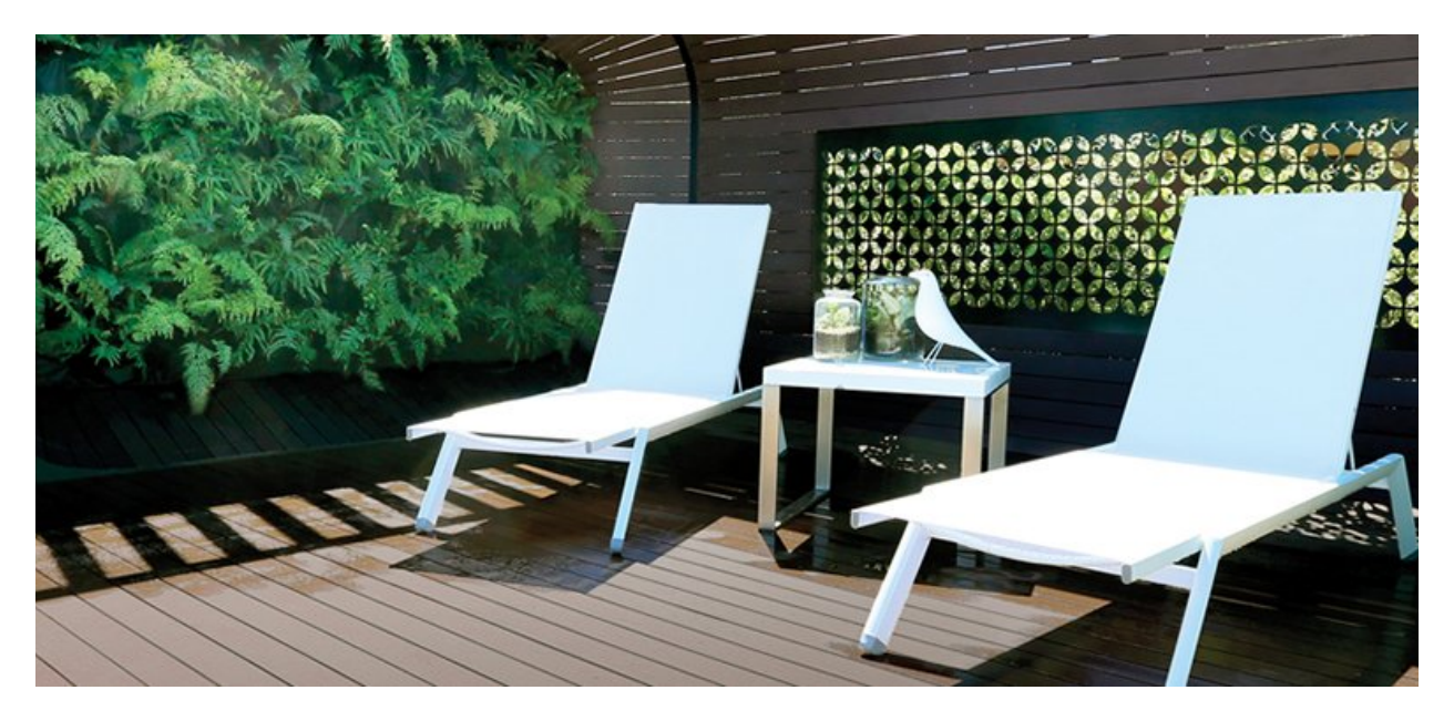
Designed especially for our weather conditions

Our PLYDECK composite decking boards are made from a combination of over 90 percent reclaimed timber, bamboo and recycled plastic. However, they've been carefully engineered and designed to look and feel like natural timber.